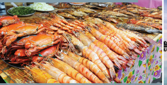
local delicacies at the night market