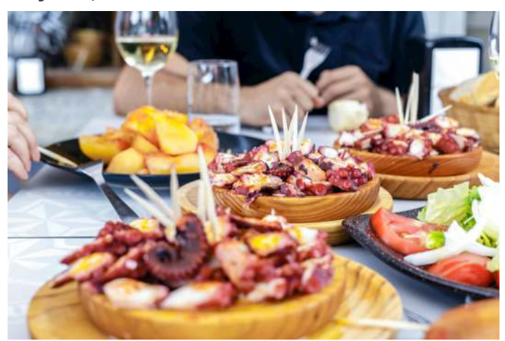
Day 13 | Adiós Madrid

For now it's time to say a fond farewell to our travelling companions, your Travel Director and the beauty of Spain and Portugal at the end of a memorable holiday.