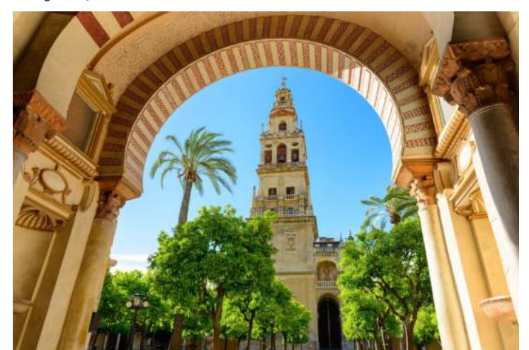
Day 4 | Onwards to Córdoba and Seville

Tread in the footsteps of Spain's last emirs, joining your Local Specialist for a visit to the incredible Alhambra, with its amazing palaces, gardens and fountains. Inspired by poetry, the architecture is said to be a reflection of paradise as described in Islamic verse. Immerse yourself in the tranquil atmosphere in quiet courtyards, follow its colossal ancient walls and admire the ornate stone carvings. We then leave Granada behind for Córdoba where we'll join a Local Specialist to visit the mesmerising Mosque of the Caliphs, a jewel of Hispano-Islamic art featuring striking arches and Byzantine mosaics. Our final stop for the day is alluring Seville, our home for the next three nights.